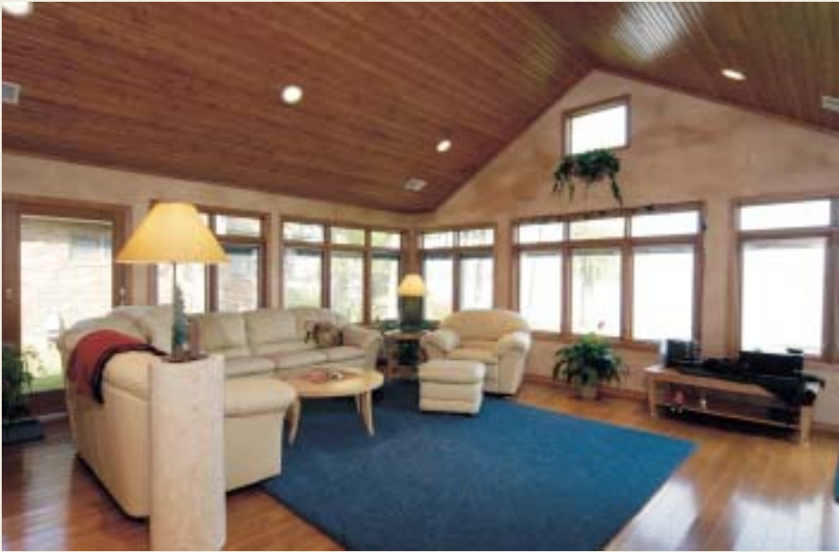
This lakeside all-seasons room which has hardwood floors and a hardwood tongue and groove ceiling that is brought together with a custom plastering technique called Craquelatto which gives the walls a cracked and aged look. (Inset photo) the exterior lakeside view of this perfectly remodeled Lake Columbia home.