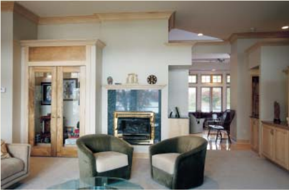
Natural colored trim, built-in curio cabinet, entertainment center, and fireplace make this living room, which is located just off the kitchen, a great place to relax after a gourmet meal.